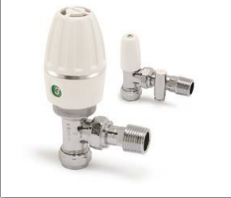
TRV & Drain Off Lockshield Pack

Angle pattern thermostatic radiator valve vertical or horizontal mounting with (367 CPDLS) matching drain off lockshield.